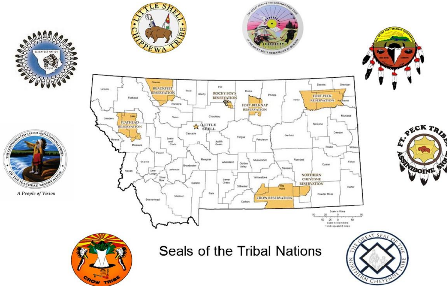
Seals of the Tribal Nations

American Indian tribal nations are inherent sovereign nations and they possess sovereign powers, separate and independent from the federal and state governments. However, under the American legal system, the extent and breadth of self-governing powers are not the same for each tribe.